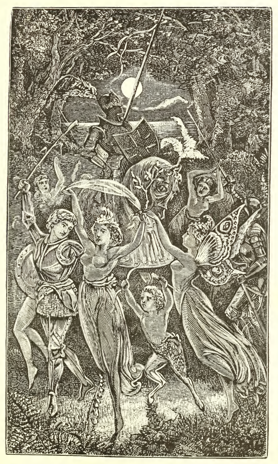
THE ENCHANTED WAR HORSE. - Page 176.