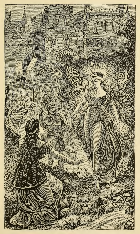
EILEEN AND THE FAIRY QUEEN. - Page 18.